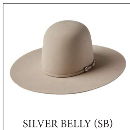
SILVER BELLY (SB)