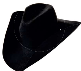
OUTBACK CODE: K HEIGHT: 3¾"