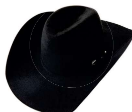
MULTI CODE: M HEIGHT: 4 ½"