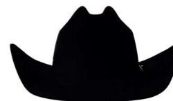
ROLL BRIM CODE: RL