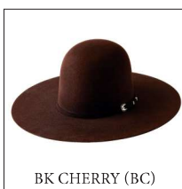
BK CHERRY (BC)