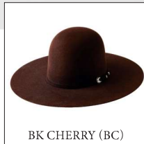
BK CHERRY (BC)

*ALSO AVAILABLE IN 5" BRIM *ALSO AVAILABLE IN VELVET