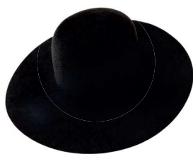
AMISH CODE: A HEIGHT: 5½"