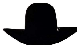
NORTENO CODE: N