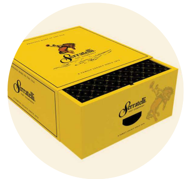
BOX SERRATELLI GOLD DRAWER DESIGN