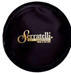
4X, 5X SERRATELLI GOLD BLACK LINER