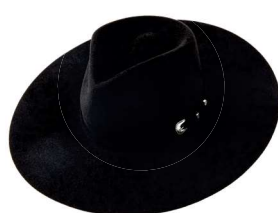
C CROWN CODE: C HEIGHT: 3¾"