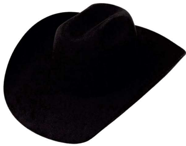
PUNCHY CODE: P HEIGHT: 5"