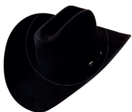
III CODE: 3 HEIGHT: 4¾"