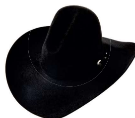
GUS CODE: G HEIGHT: 6"