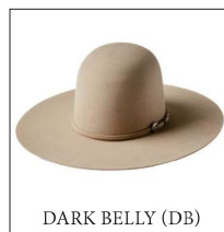
DARK BELLY (DB)