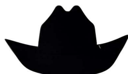
OUTBACK CODE: K