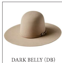
DARK BELLY (DB)