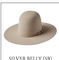
SILVER BELLY (SB)