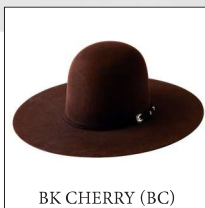
BK CHERRY (BC)

*ALSO AVAILABLE IN 5" BRIM *ALSO AVAILABLE IN JUNIOR