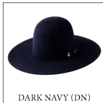
DARK NAVY (DN)