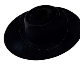
NEVADA CODE: 7 HEIGHT: 4¾"