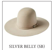
SILVER BELLY (SB)