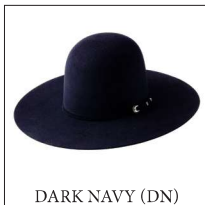
DARK NAVY (DN)