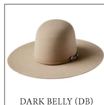
DARK BELLY (DB)