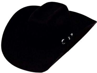
L CROWN CODE: L HEIGHT: 5"