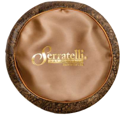
20X, 40X, 100X SERRATELLI GOLD PAISLEY JACQUARD LINER