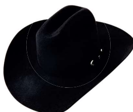
V CODE: 5 HEIGHT: 4⅜"