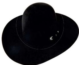
OPEN CODE: O HEIGHT: 6"