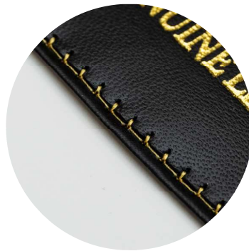
SWEATBAND SERRATELLI GOLD THREAD GENUINE GOAT LEATHER