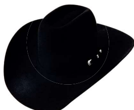
IV CODE: 4 HEIGHT: 4½"