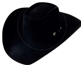
BRICK CODE: 6 HEIGHT: 4¾"