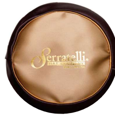
6X, 8X, 10X SERRATELLI GOLD DUAL-TONE LINER