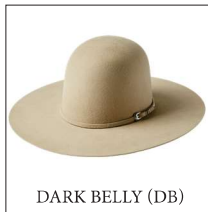
DARK BELLY (DB)