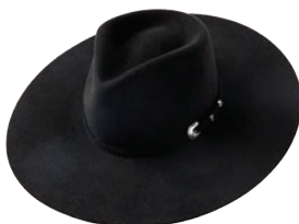
C CROWN CODE: C HEIGHT: 3 7/8"