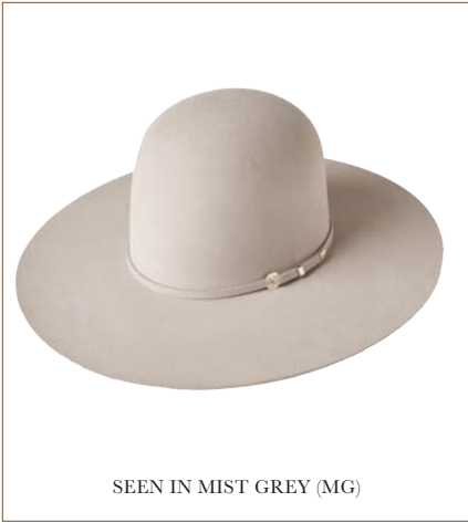
SEEN IN MIST GREY (MG)