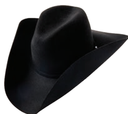
OUTBACK CODE: K HEIGHT: 3 7/8"