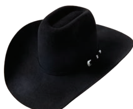
IV CODE: 4 HEIGHT: 4 1/2"