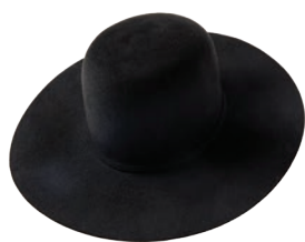
AMISH CODE: A HEIGHT: 5 1/2"