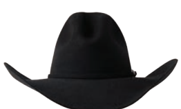
OUTBACK CODE: K