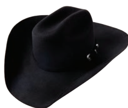
IX CODE: 9 HEIGHT: 4 5/16"