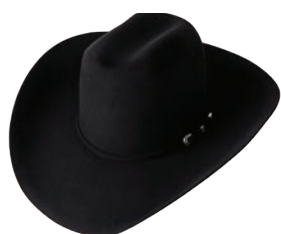
PUNCHY CODE: P HEIGHT: 5"