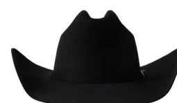
WIDE SHOVEL CODE: W