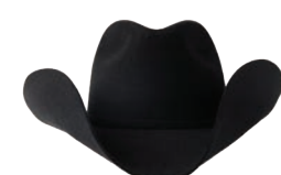
ROLL BRIM CODE: RL