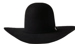
NORTENO CODE: N