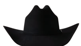
SHOVEL CODE: S