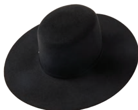
HERITAGE CODE: H HEIGHT: 4 1/2"