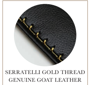
SERRATELLI GOLD THREAD GENUINE GOAT LEATHER