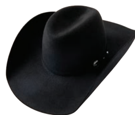
MULTI CODE: M HEIGHT: 4 1/2"