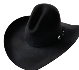
GUS CODE: G HEIGHT: 6"