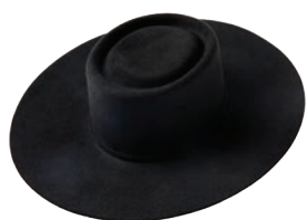
NEVADA CODE: 7 HEIGHT: 4 1/8"