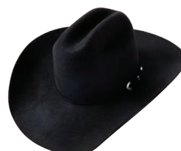
V CODE: 5 HEIGHT: 4 3/16"