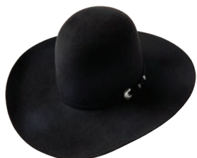
OPEN CODE: O HEIGHT: 6"