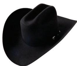
III CODE: 3 HEIGHT: 4 3/8"