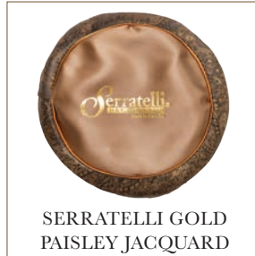
SERRATELLI GOLD PAISLEY JACQUARD