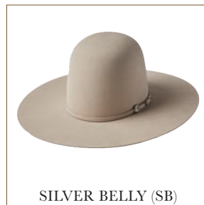
SILVER BELLY (SB)